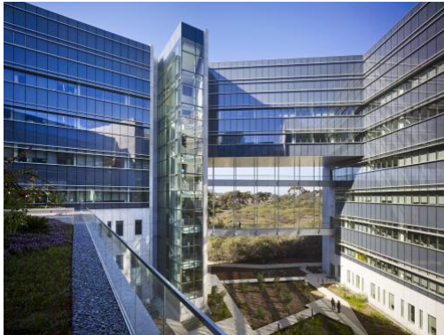
Altman Clinical Translational Research Institute

In brand-new facilities with state-of-the-art equipment for translational research