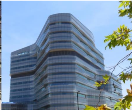
Jacobs Medical Center