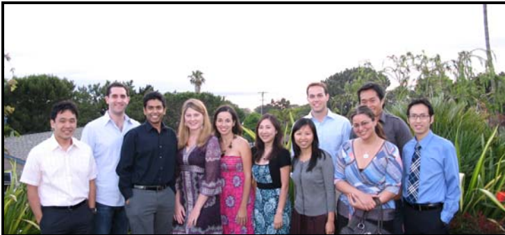
Current GI Fellows with the Graduating Fellows