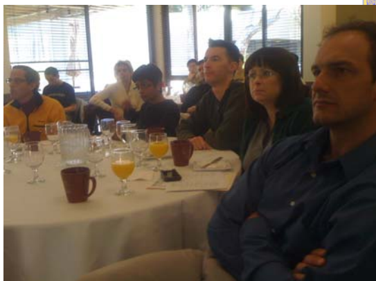
Attendees taking in a presentation