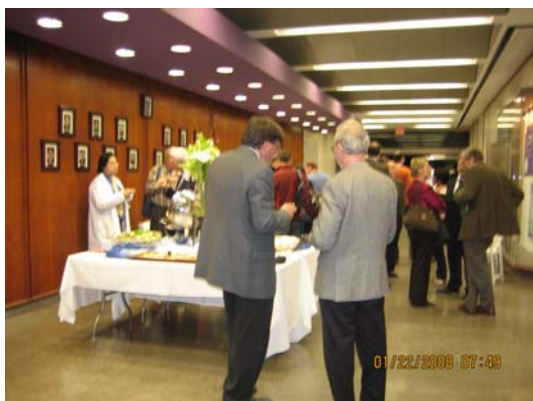
Post-Lecture Reception in BSB Hallway

Title: "Making Innate Good Sense: Tolls and CARD Tricks in the Epithelium"